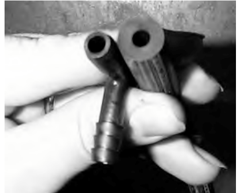
Above: zip T-pipe and the same zip hose. Note picture taken by zip customer from the internet.