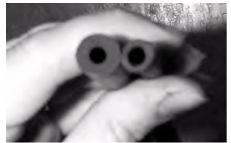
Above: zip oversize hose and the much smaller factory.

Blem Products would Not recognize Research -- "If they Stepped in it, Got it on their shoe and it Stunk like you know what" and you can quote me on that.